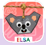
Patterns & Relationships