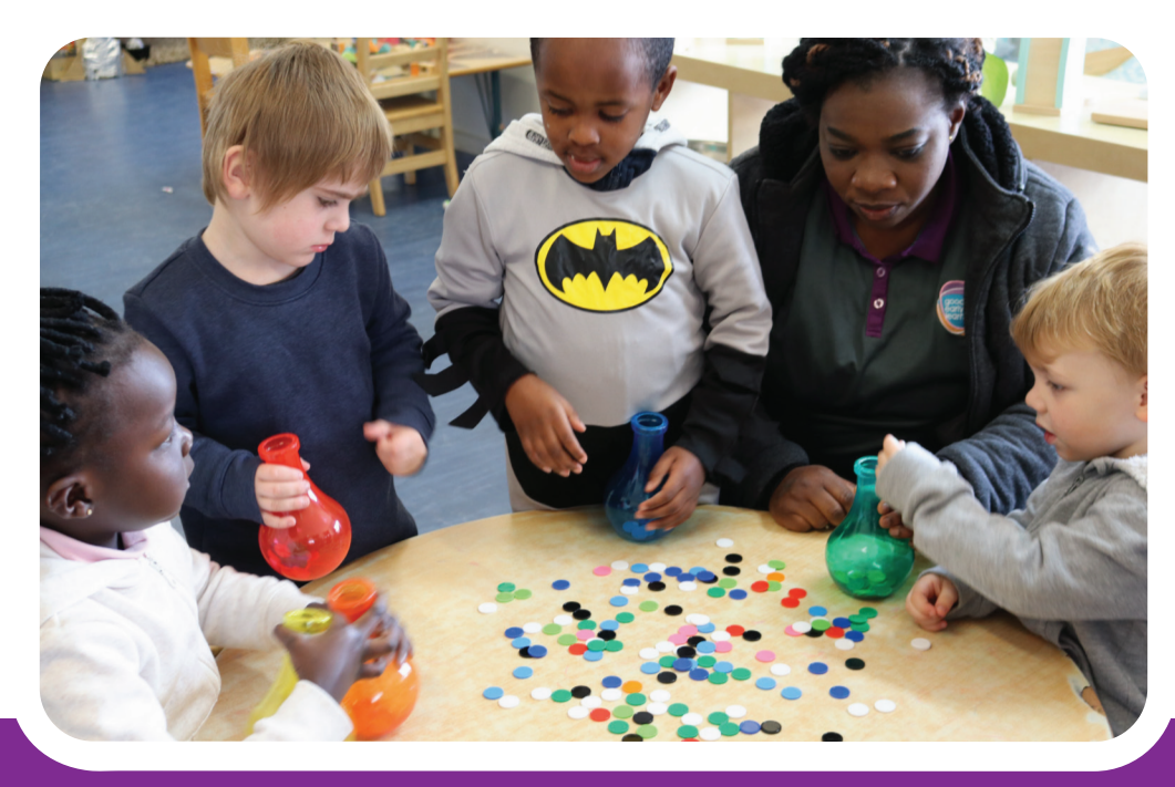
Sorting counters according to colour into potion bottles