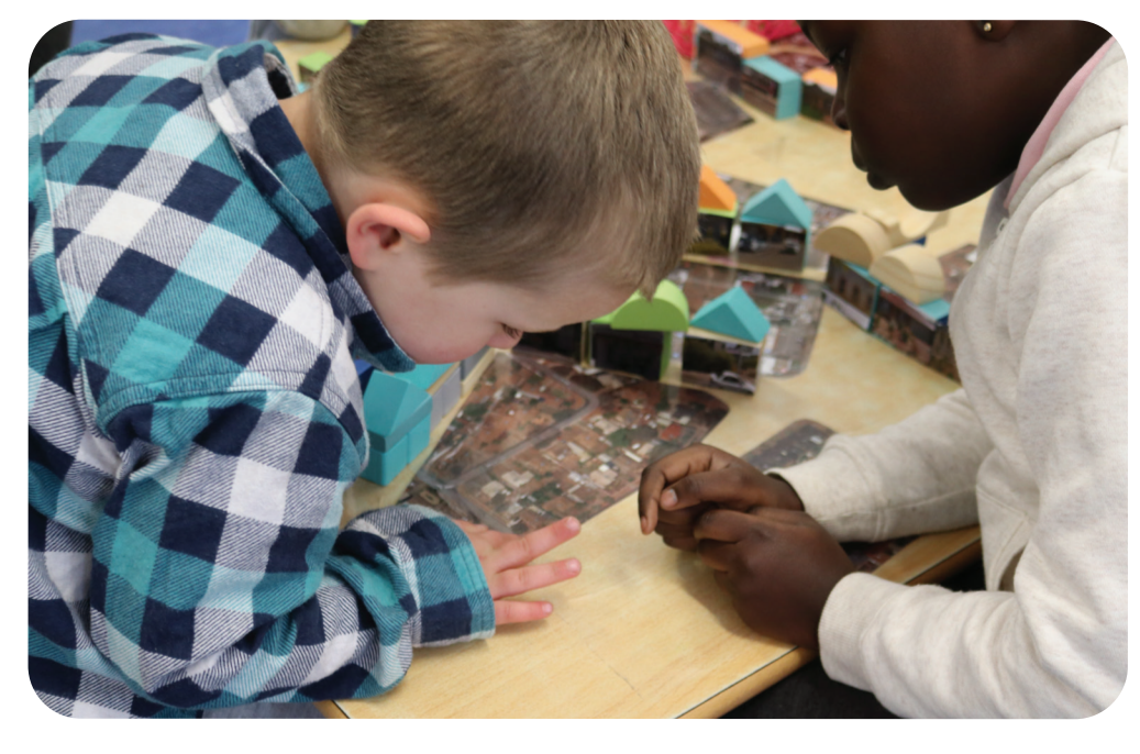
Finding locations on the map

The children really like patterning. It's non-stop, 6:30 in the morning they're creating a pattern with anything in the room – they're always like, 'Look at my pattern, look at my pattern'. We used to do it just in the morning, but now they just do it throughout the day themselves. It's not a routine that we're doing planning, they just take it on themselves, it's their own initiatives which is really good.