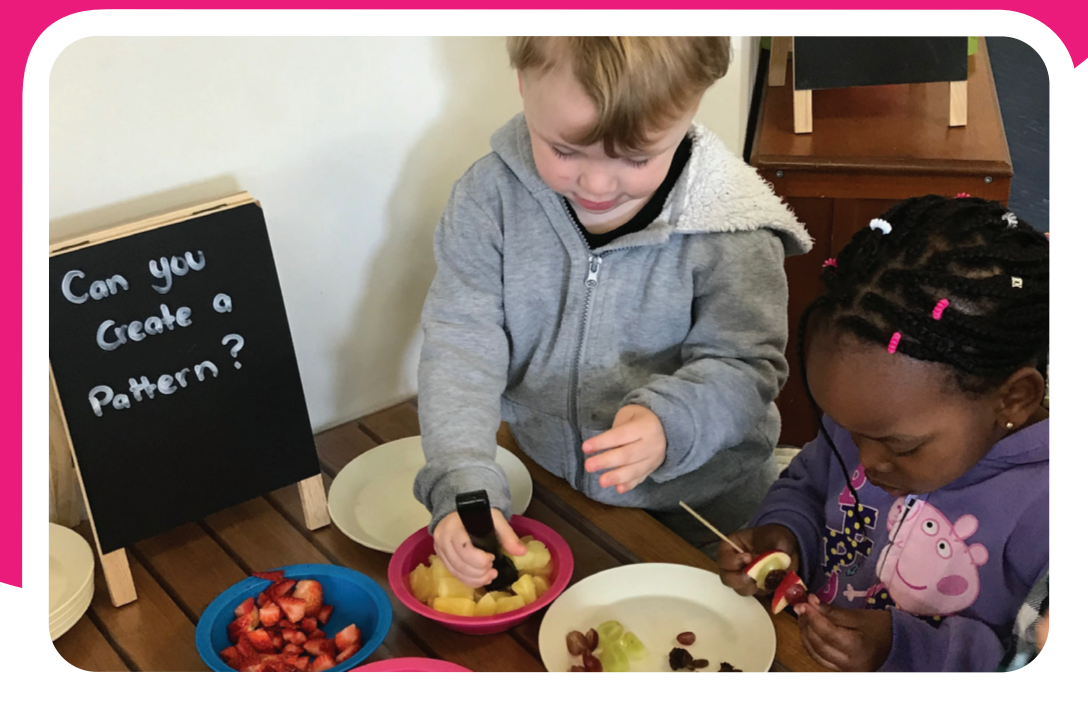
Making patterns with fruit

We work to provide children and their families with a safe and challenging environment while offering early intervention strategies to assist children who might be at risk or disadvantaged. Our centres' approach is an all-of-community one. We have a Child and Family Practitioner, a Speech Pathologist and an Occupational Therapist who make regular visits to our centre. We offer a Food Bank service for our families and our chef prepares extra meals every day for parents to take home. Our centre works to provide parents with support, community and information to assist with day-to-day life.