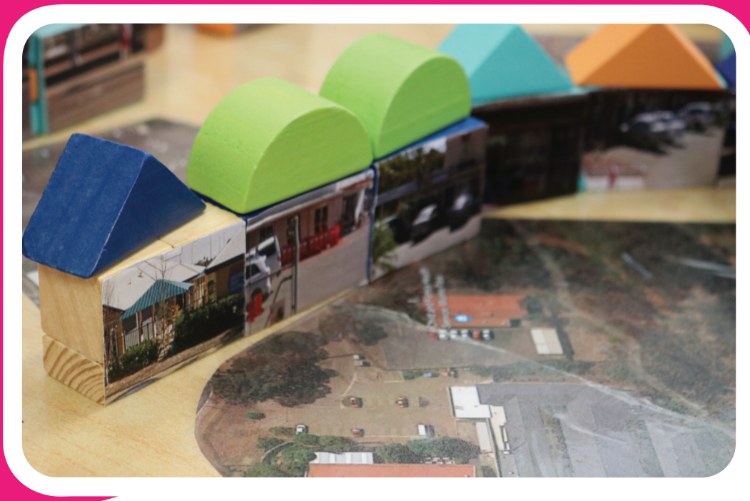
Creating their community using blocks with photos

They're really enjoying birds eye view and understanding where they are and drawing their own maps and turning it into 3D using blocks with their photos that we took out on the street. And then we've used Google images and technology to try and make it further. Now they constantly say, 'Can we go for a walk today?'